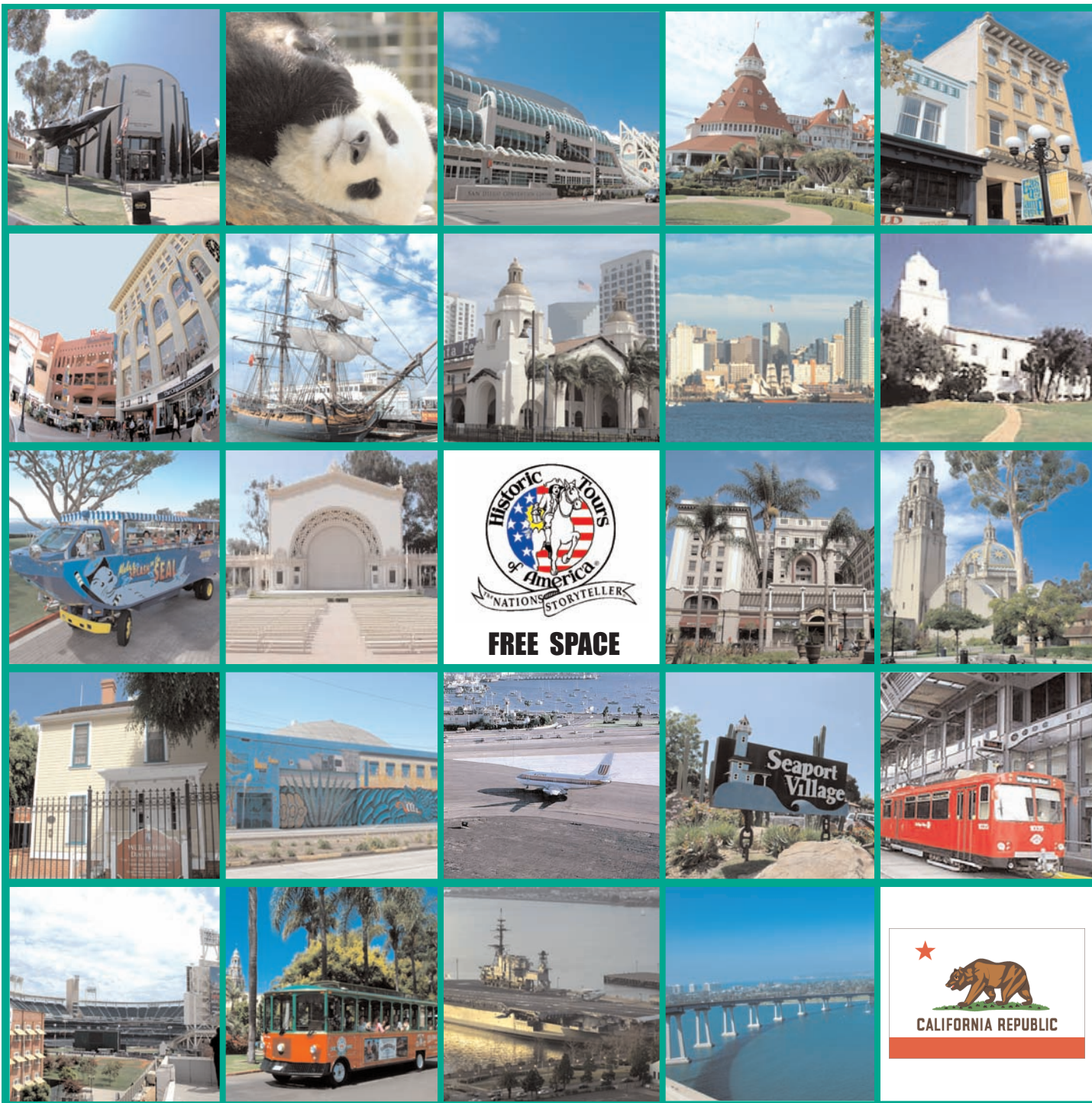
Aerospace Museum Horton Plaza San Diego Seals William Heath Davis House Petco Park

CROSS OUT EACH OF THE SITES AS YOU PASS THEM. FIVE BOXES IN A ROW EITHER UP, DOWN, RIGHT, LEFT OR DIAGONAL TO WIN. WHEN YOU DO, YELL "BINGO!"