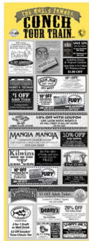
Coupon Sheet Example

All art production is at the client's expense. Please inquire about cost. Discounts are available in conjunction with other Historic Tours of America advertisement opportunities.